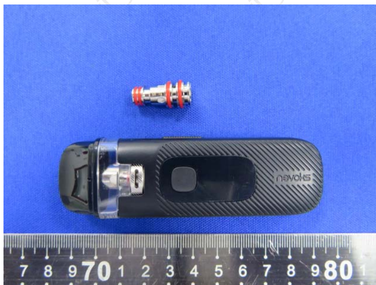
Nevoks Veego pod mod with 1.0ohm, Kanthal/0.6ohm, Kanthal